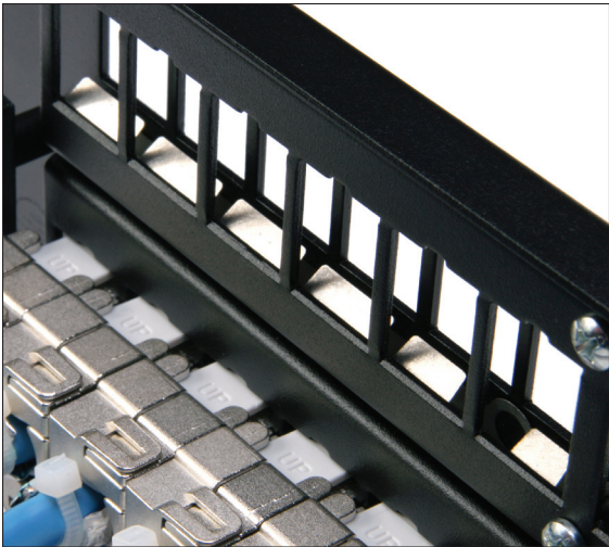
The stainless steel plate ensures a proper ground path between the connector and the panel.